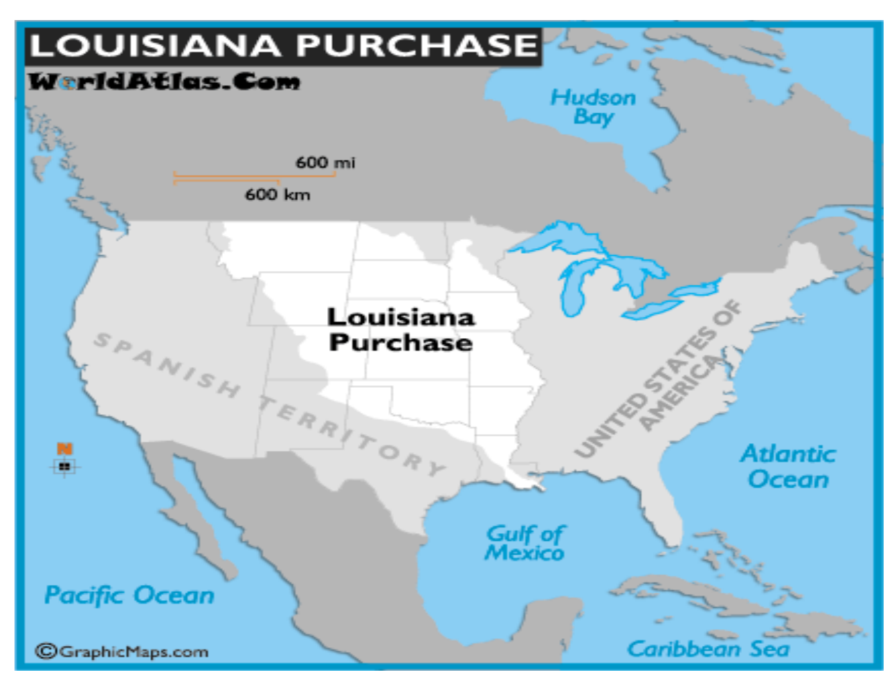
Document D: WorldAtlas.com